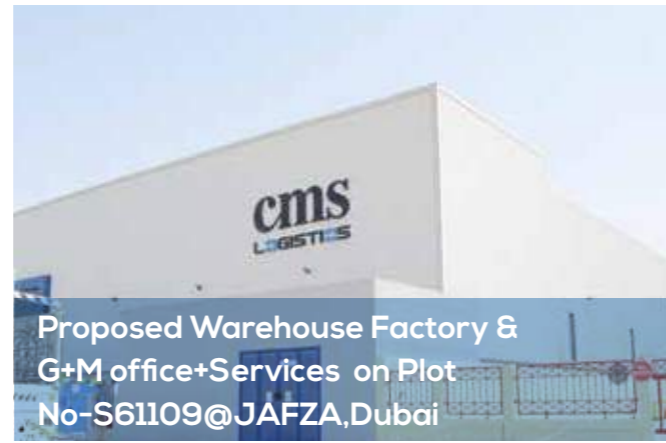
Proposed Warehouse Factory & G+M office+Services on Plot No-S61109@JAFZA,Dubai