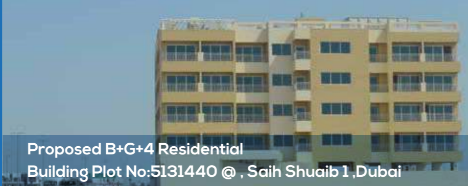
Proposed B+G+4 Residential Building Plot No:5131440 @ Saih Shuaib 1, Dubai

Client : - Hassan Hammoud Main Contractor : - CHC contracting Consultants : - Corporate Planners Engineering Consultants Scope of Works : - DX units Split, FAHU, Ductable DX units