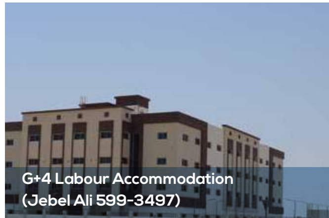
G+4 Labour Accommodation (Jebel Ali 599-3497)

Client : - CMS Logistics LLC Main Contractor : -Loyal Contracting LLC Consultant : - S J Lewis Engineering Consultants Scope of Works : - HVAC works ( Package& Ducted Split