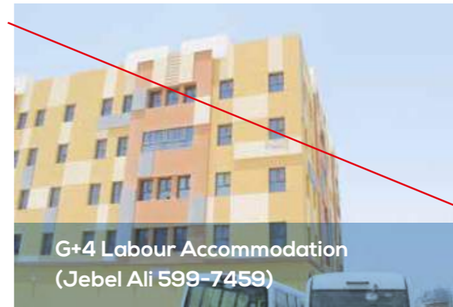
G+4 Labour Accommodation (Jebel Ali 599-7459)

Client : - Makeen Properties Main Contractor : - Family Star Construction LLC Consultant : - Winner Holistic Consultant. Type of AC Units : - HVAC works (VRF System @ Mitsubishi - 200 Rooms)