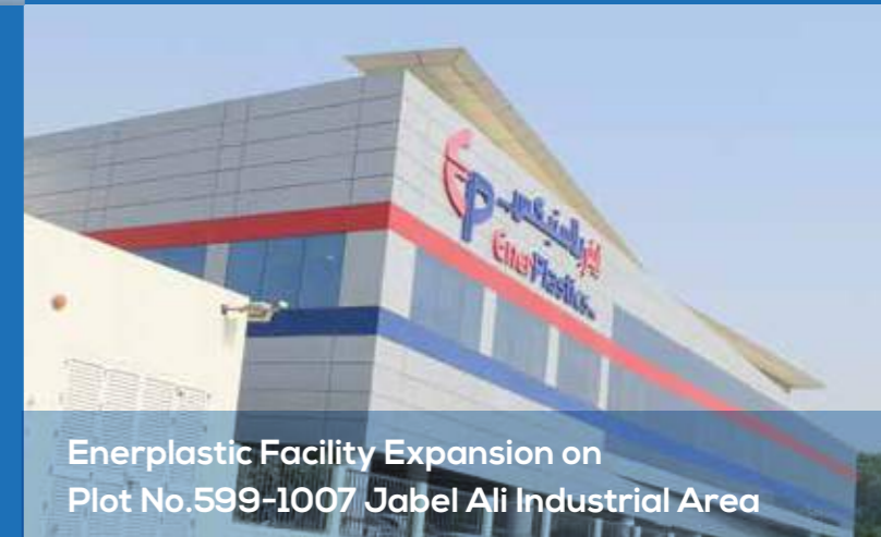
Enerplastic Facility Expansion on Plot No.599-1007 Jabel Ali Industrial Area

Client : - NOV Fabtech Main Contractor : - Fabtech Contracting LLC Consultants : - A2Z Engineering Consultants Scope of Work : - DX units Split, FAHU (York) and Closed Control Units (Schultz)