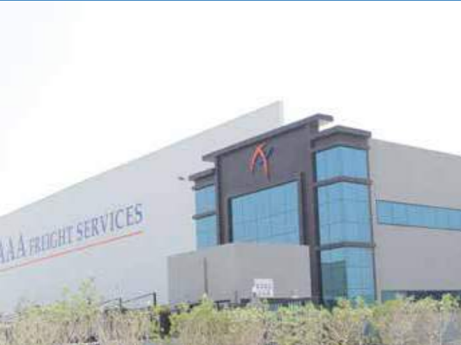
Proposed G+M Office & Warehouse Jebel Ali South, Dubai, UAE

Client : - United Furniture CO. LLC Main Contractor : - Al Avon Contracting LLC Consultant : - Chawla Architectural & Consulting Engineers Scope of Works : - HVAC works -DX units Split, FAHU (LG)