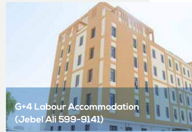
G+4 Labour Accommodation (Jebel Ali 599-9141)