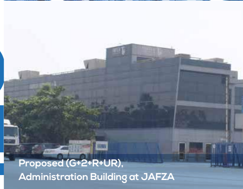
Proposed (G+2+R+UR), Administration Building at JAFZA

Client : - NOV Fabtech Main Contractor : - Fabtech Contracting LLC Consultants : - A2Z Engineering Consultants Scope of Work : - DX units Split, FAHU (York) and Closed Control Units (Schultz)