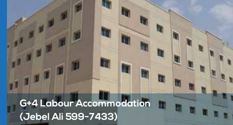
G+4 Labour Accommodation (Jebel Ali 599-7433)

Client : - Meraas Estates LLC Main Contractor : - Family Star Construction L.L.C Consultant : - Edmac Engineering Consultant Scope of Works : - HVAC works (VRF System @ LG- 272 Rooms)