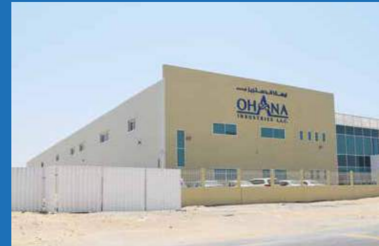
Proposed Warehouse Factory & G+M Office @ Technopark

Client : - Ohana Industries LLC Main Contractor : - Multilink Contracting LLC Consultant : - Model Engineering consultants Scope of Works : - HVAC works ( VRF System @ Rheem)