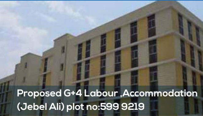
Proposed G+4 Labour Accommodation (Jebel Ali) plot no:599 9219

Client : - Accord Trading LLC Main Contractor : - Consteel Foundations & Construction LLC Consultant : - SpaceTech Engineering Consultancy Scope of Works : - DX units Split, FAHU (Rheem)