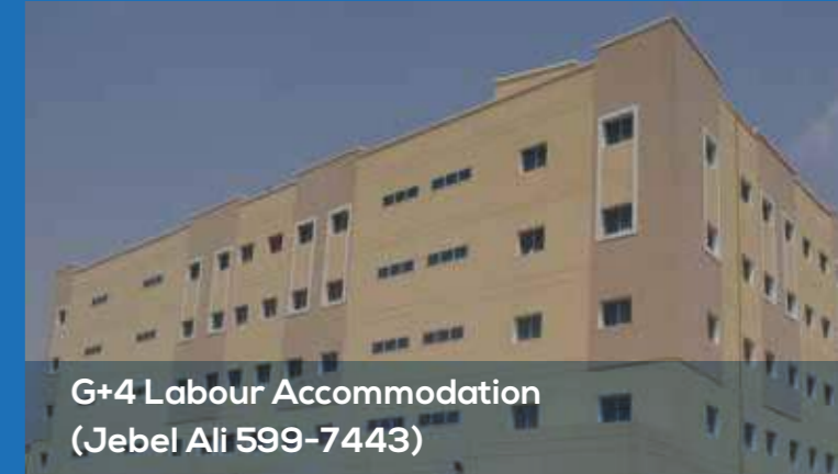
G+4 Labour Accommodation (Jebel Ali 599-7443)