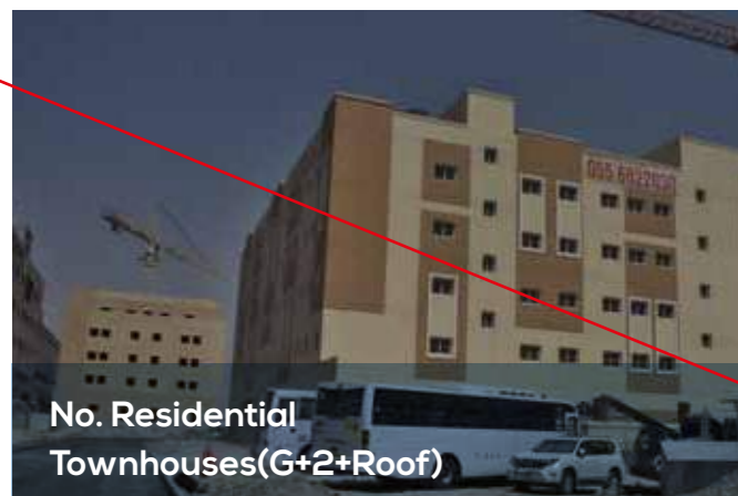
No. Residential Townhouses(G+2+Roof)