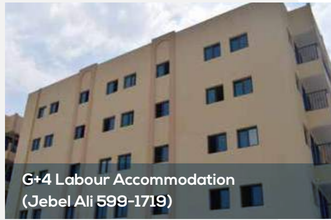
G+4 Labour Accommodation (Jebel Ali 599-1719)