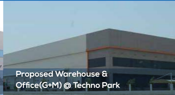
Proposed Warehouse & Office(G+M) @ Techno Park

Client : - United Furniture CO. LLC Main Contractor : - Al Avon Contracting LLC Consultant : - Chawla Architectural & Consulting Engineers Scope of Works : - HVAC works -DX units Split, FAHU (LG)