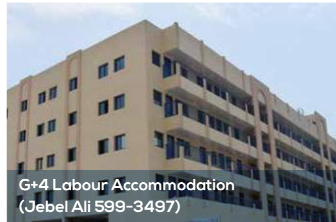
G+4 Labour Accommodation (Jebel Ali 599-3497)

Client : - Standard Carpet Main Contractor : - Family Star Construction LLC Consultant : - Winner Holistic Consultant. Scope of Works : - HVAC works (DX Ducted split AC @ Rheem)