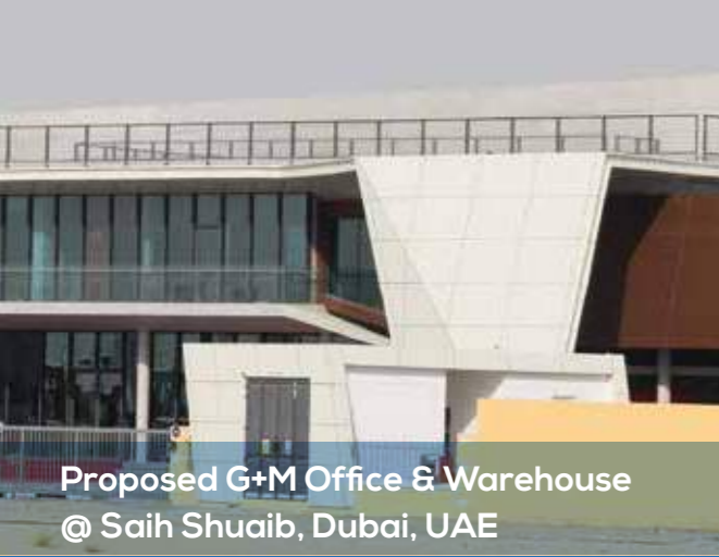
Proposed G+M Office & Warehouse @ Saih Shuaib, Dubai, UAE

Client : - M/S OP3 Technical Services LLC Main Contractor : - Al Avon Contracting LLC Consultant : - Design House Engineering Consultancy Scope of Works : - DX units Split, FAHU, Ductable DX units