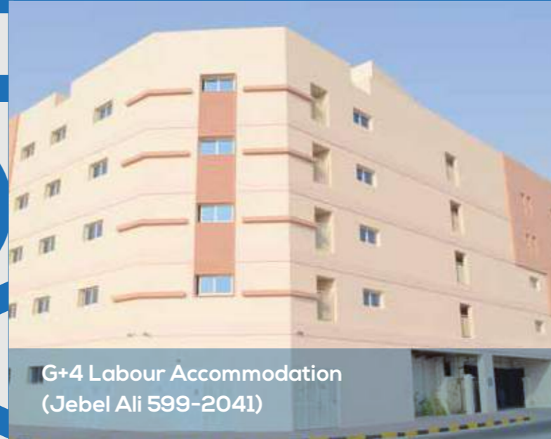
G+4 Labour Accommodation (Jebel Ali 599-2041)

Client : - United Group Holding Main Contractor : - Family Star Construction LLC Consultant : - Group Consultant International Scope of Works : - HVAC works (VRF System @ LG - 436 Rooms)