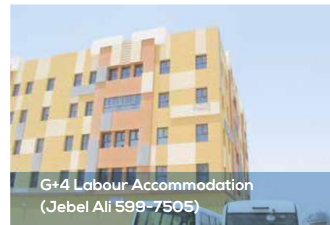
G+4 Labour Accommodation (Jebel Ali 599-7505)

Client : - AGIO IMAGE Main Contractor : - Family Star Construction L.L.C Consultant : - Edmac Engineering Consultant. Type of AC Units : - HVAC works (VRF System @ York -236 Rooms)